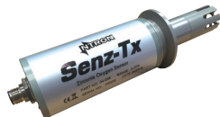
Senz-TX Oxygen Sensor Transmitter