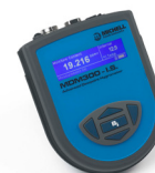
MDM300 Dew-Point Hygrometer