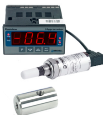
Easidew Online Dew-Point Hygrometer