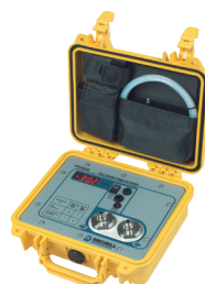
MDM50 Portable Hygrometer