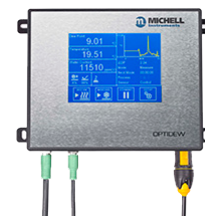
Optidew 501 Chilled Mirror Hygrometer

Michell Instruments Ltd 48 Lancaster Way Business Park, Ely, Cambridgeshire, CB6 3NW Tel: +44 (0) 1353 658000, Fax: +44 (0) 1353 658199, Email: uk.info@michell.com , Web: www.michell.com/uk Michell Instruments adopts a continuous development programme which sometimes necessitates specification changes without notice. Issue no: Easidew Portable_97157_V5.2_UK_0620