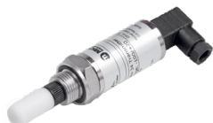
Easidew Tx Industrial Dew-Point Transmitter