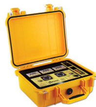
YellowBox Portable Portable Oxygen Analyzer